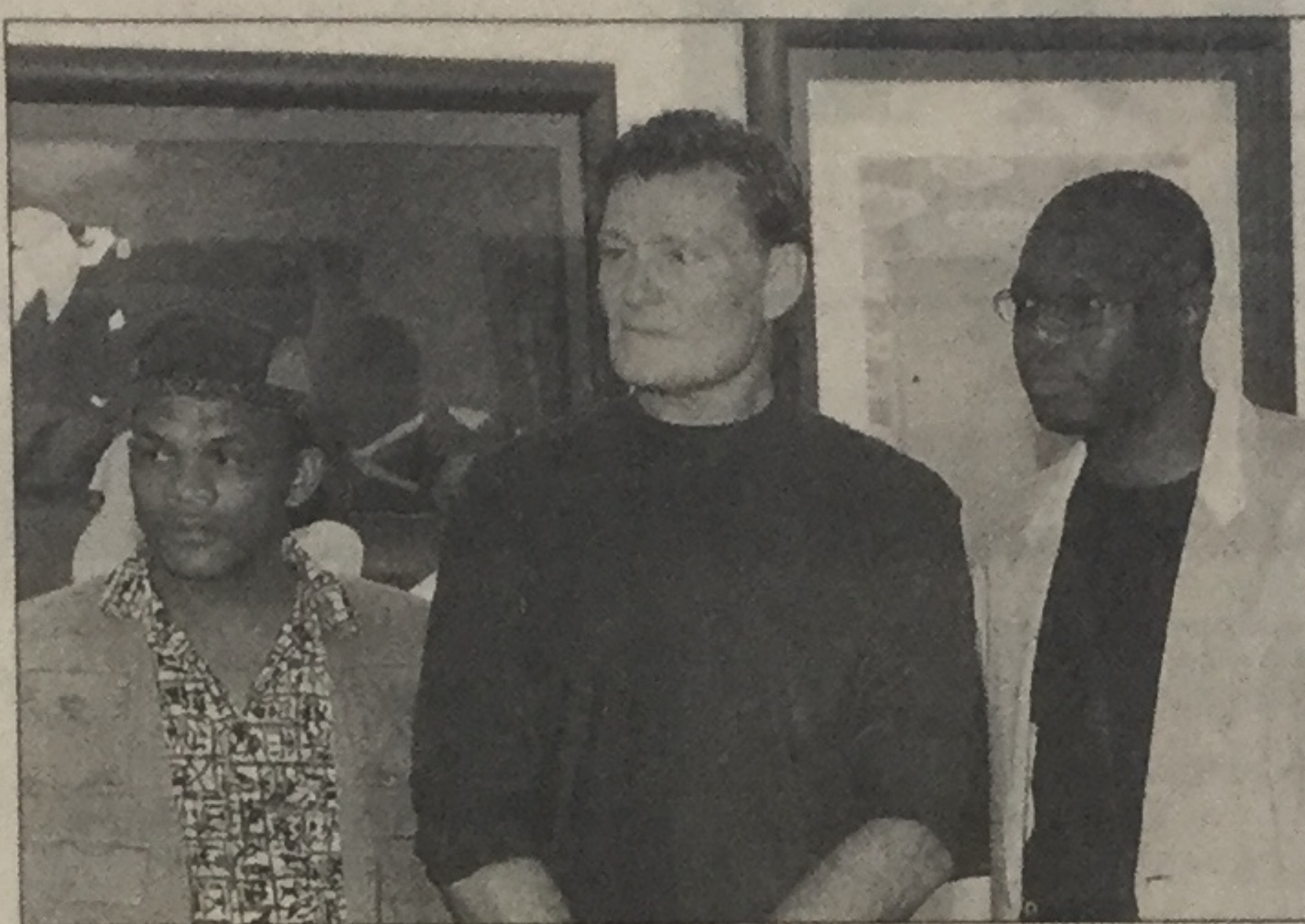
THE INVISIBLES: From left to right, Willie Bester, Louis Jansen Van Vuuren and Zwelethu Mtheth