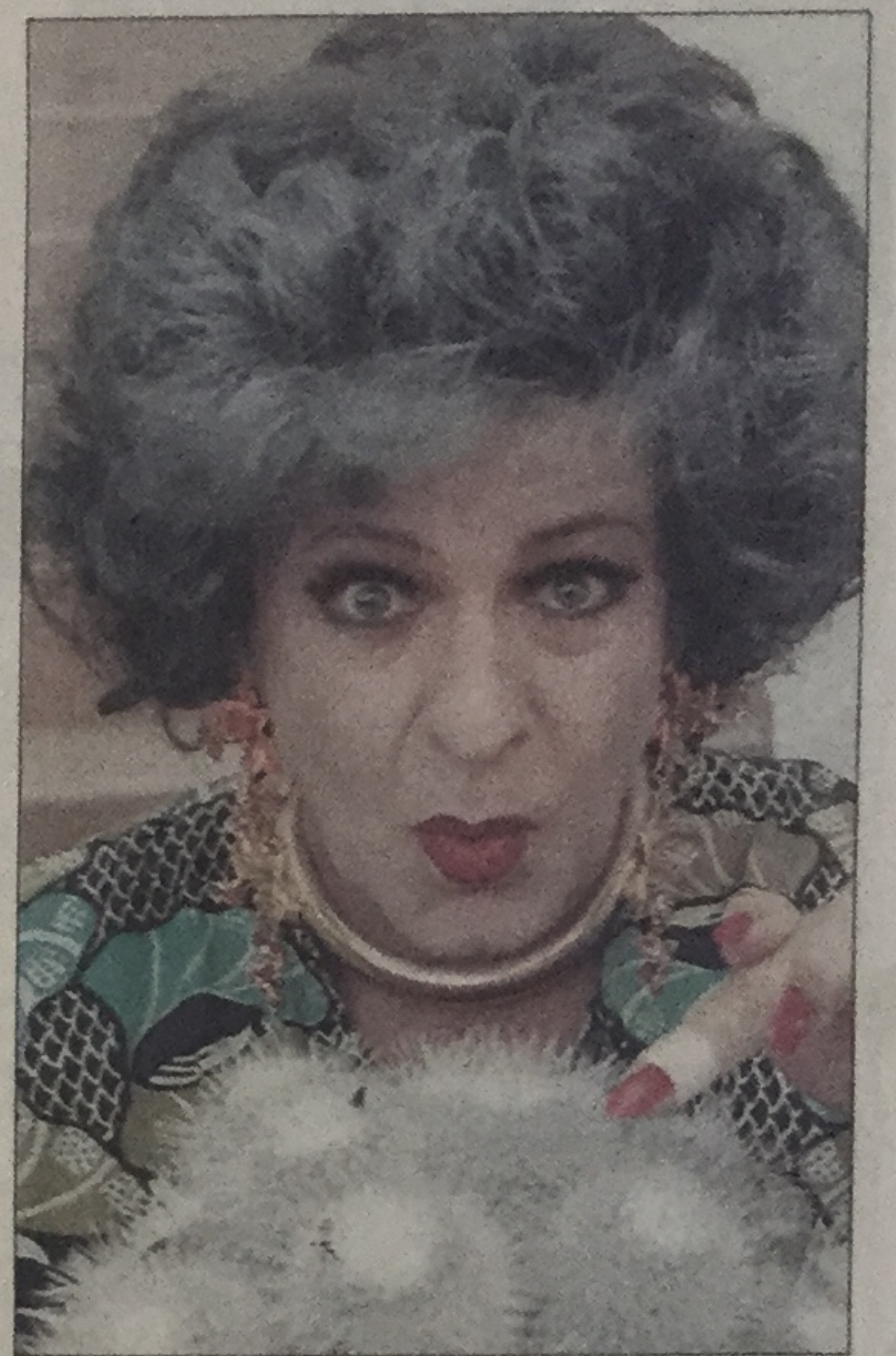
JOINING THE GOGGAS: Pieter-Dirk Uys.